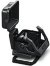
HEAVYCON EVO panel mounting base, plastic, B6, with single locking latch, height: 30.5 mm, with flat gasket, with protective cover

Please be informed that the data shown in this PDF Document is generated from our Online Catalog. Please find the complete data in the user's documentation. Our General Terms of Use for Downloads are valid ( http://phoenixcontact.com/download )