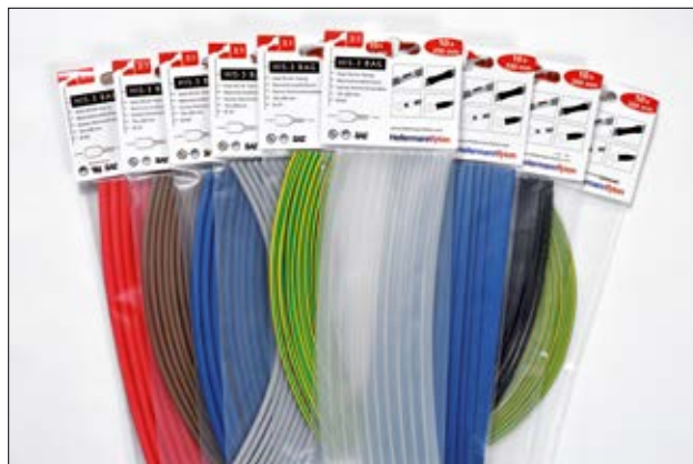
HIS-3 BAG available in seven colours and four sizes.