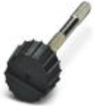
Fillister head screw with plastic knurl, M3 x 40

Screw - SAC-V-SCREW-M3-29 KNURL - 1403779