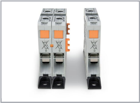
Align and snap high-current, through terminal blocks together.

Subject to changes. Please also observe the further product documentation!