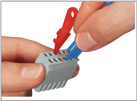
Conductor termination parallel to CAGE CLAMP® actuation

Subject to changes. Please also observe the further product documentation!