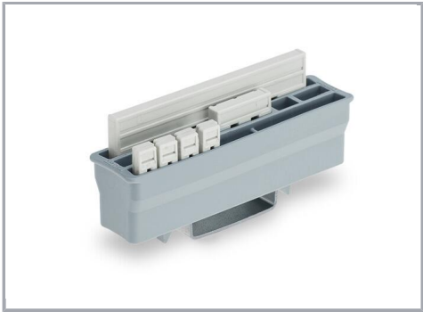
Collective carrier for TOPJOB® S Jumpers

TOPJOB® S: In various industrial applications and modern building installations, WAGO's wide and versatile range of rail-mount terminal blocks provides more than just reliable electrical connections.