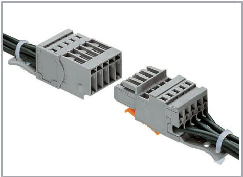
Strain relief plates can be snapped into both male connector and female plug.

Subject to changes. Please also observe the further product documentation!