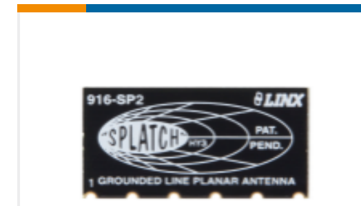
TE Part #ANT-916-SP Antenna SP PCB RPC 916MHz SMT