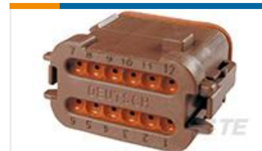
TE Part #DT06-12SD-EP06 PLG, 12P, BRN, N, SEAL RET, ENH KEY, CAP, D