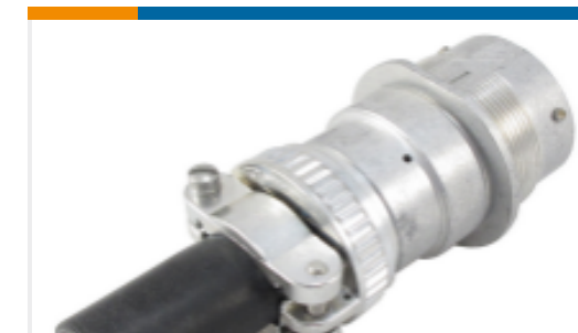
TE Part #HD34-24-31PT-059 REC, 31P, AL, T, CBL CLMP BT, DRAIN, 16, P, MC