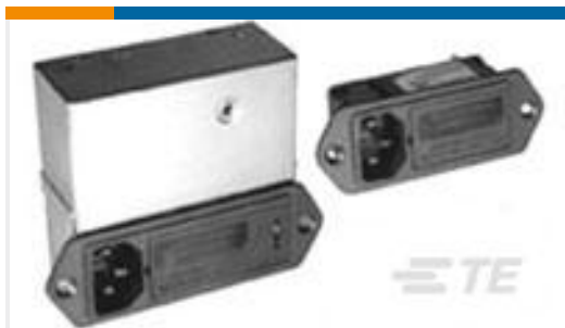
TE Part #3-6609128-5 6VM4S=F8103