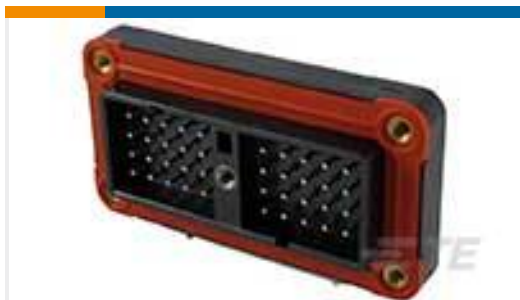
TE Part #DRC13-40PA HDR, 40P, BLK, RA, 1032 FLG, SN/NI /CU, A