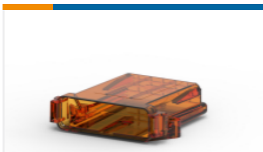
TE Part #EEC-325X4A-E016 ENCLOSURE, 3.25 X 4, CLR, VENT