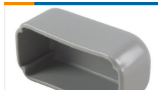
TE Part #DTM12P-DC PROTECT CVR, 12P, REC, GRY, DTM