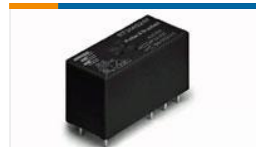
TE Part #2-1419108-8 RTD14005F