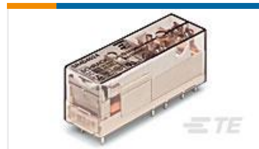
TE Part #7-1415054-1 SR4D4005