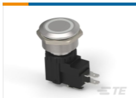
TE Part #2364698-1 AVH25 FLT SS MT NO LED 16A