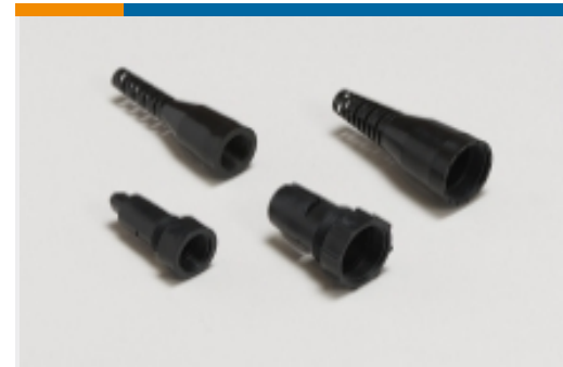
Connector Strain Relief(1)