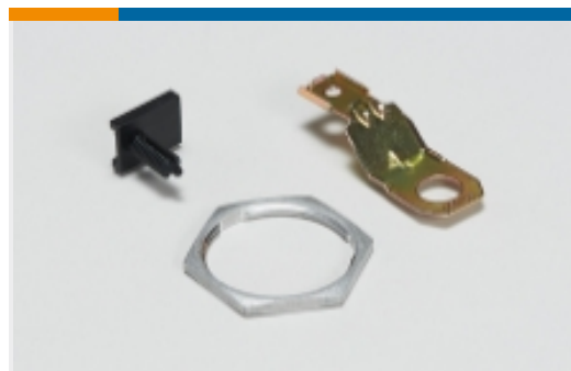
Other Automotive Connector Accessories(6)