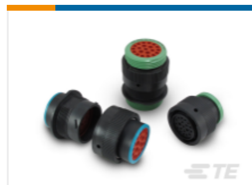
TE Part #YHDP26-24-29SEL024 DEUTSCH HDP20 Housings