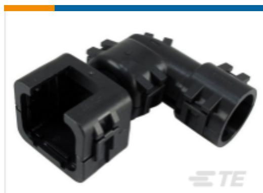
TE Part #2302493-2 SOC CONN CVRASSY,2POS, AMPSEAL16,90DEG,MC