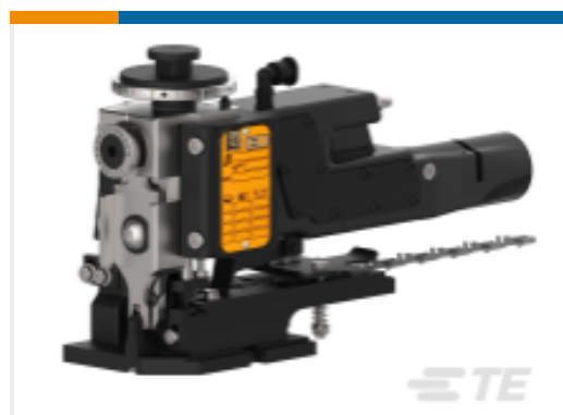
TE Part #2150133-2 OCEAN_2.0_Applicator-E-140F