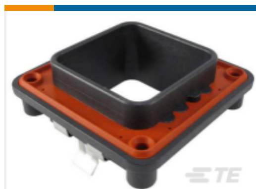
TE Part #DRBF-2B FLANGE, MOUNT, 60/48P, BLK, B