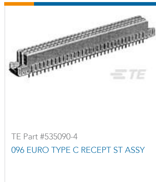
TE Part #535090-4 096 EURO TYPE C RECEPT ST ASSY