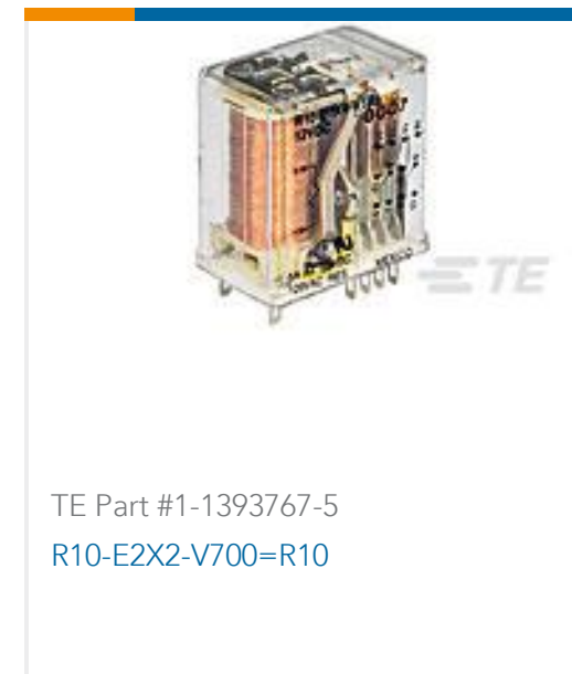
TE Part #1-1393767-5 R10-E2X2-V700=R10