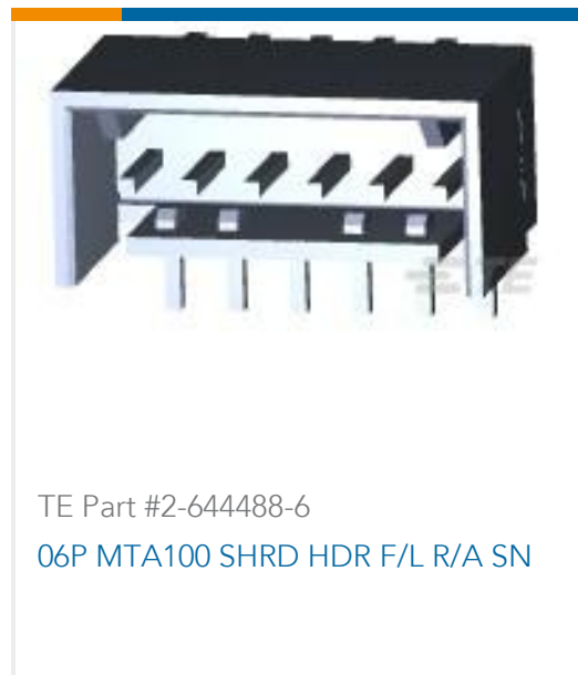
TE Part #2-644488-6 06P MTA100 SHRD HDR F/L R/A SN