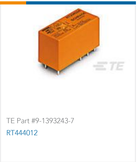
TE Part #9-1393243-7 RT444012