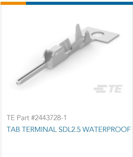
TE Part #2443728-1 TAB TERMINAL SDL2.5 WATERPROOF