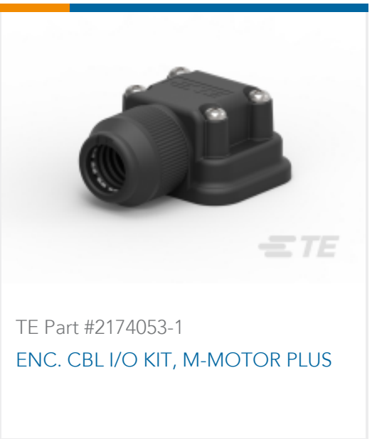
TE Part #2174053-1 ENC. CBL I/O KIT, M-MOTOR PLUS