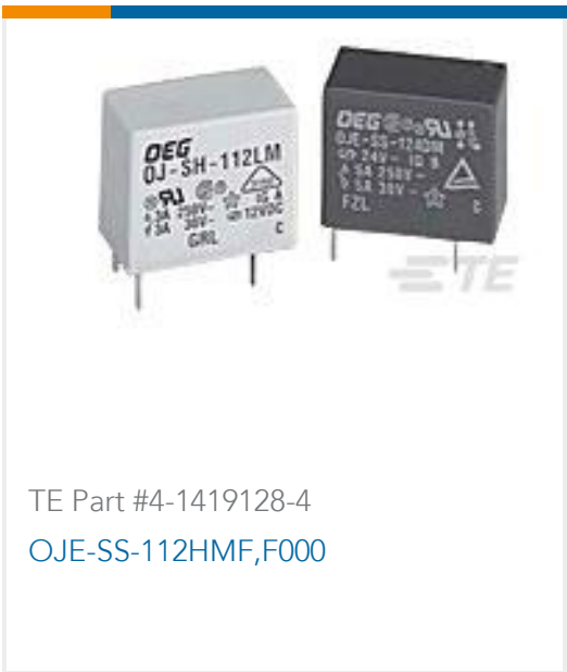
TE Part #4-1419128-4 OJE-SS-112HMF,F000