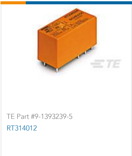
TE Part #9-1393239-5 RT314012