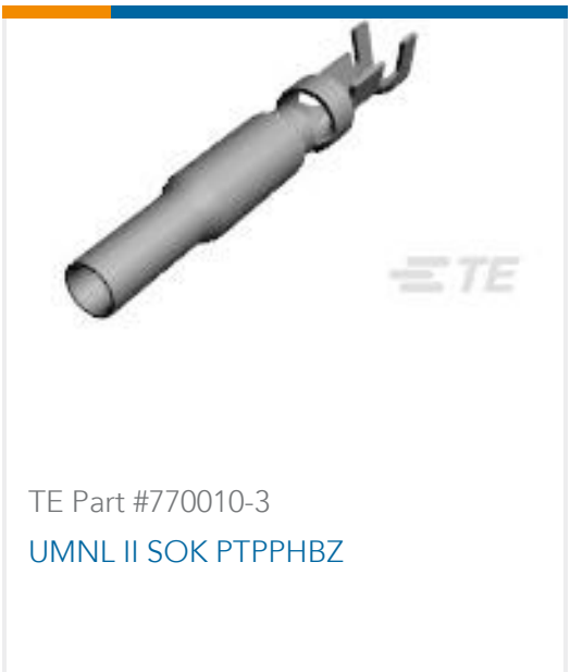
TE Part #770010-3 UMN II SOK PTPPHBZ