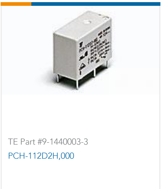
TE Part #9-1440003-3 PCH-112D2H,000