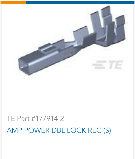
TE Part #177914-2 AMP POWER DBL LOCK REC (S)