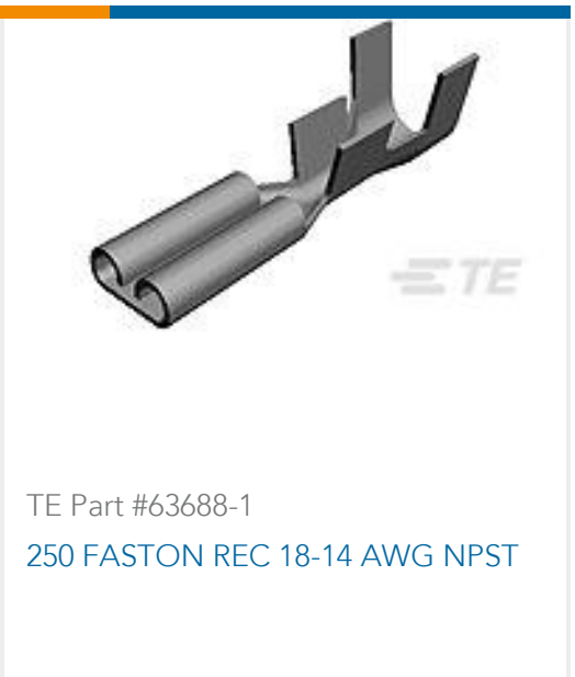
TE Part #63688-1 250 FASTON REC 18-14 AWG NPST