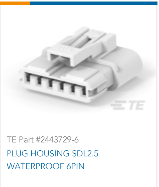
TE Part #2443729-6 PLUG HOUSING SDL2.5 WATERPROOF 6PIN