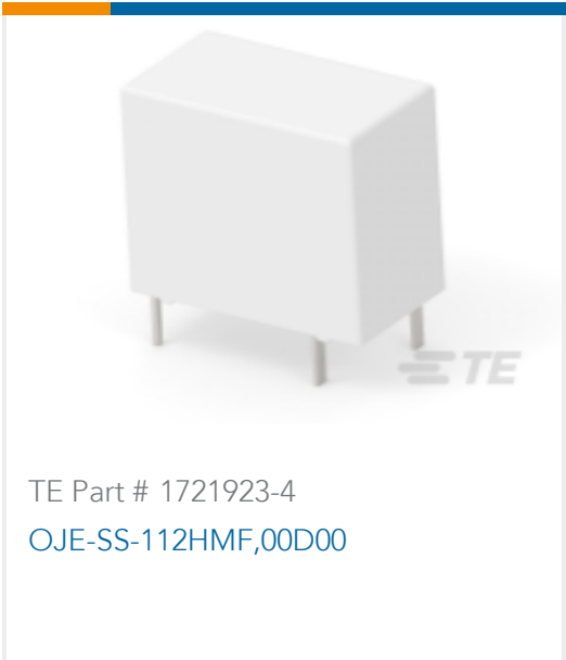
TE Part # 1721923-4 OJE-SS-112HMF,00D00