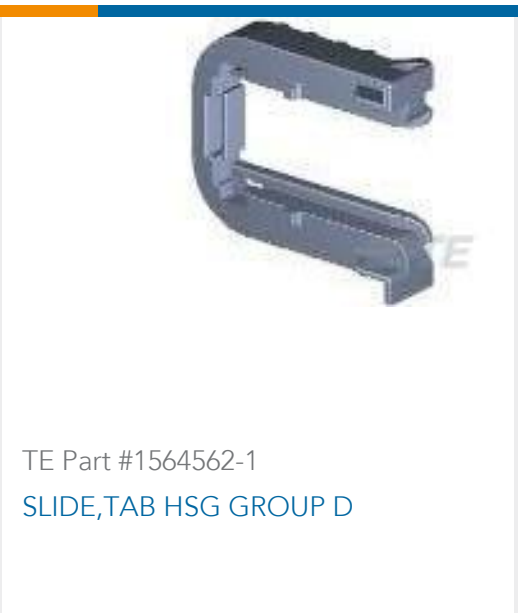
TE Part #1564562-1 SLIDE,TAB HSG GROUP D