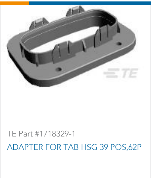
TE Part #1718329-1 ADAPTER FOR TAB HSG 39 POS,62P