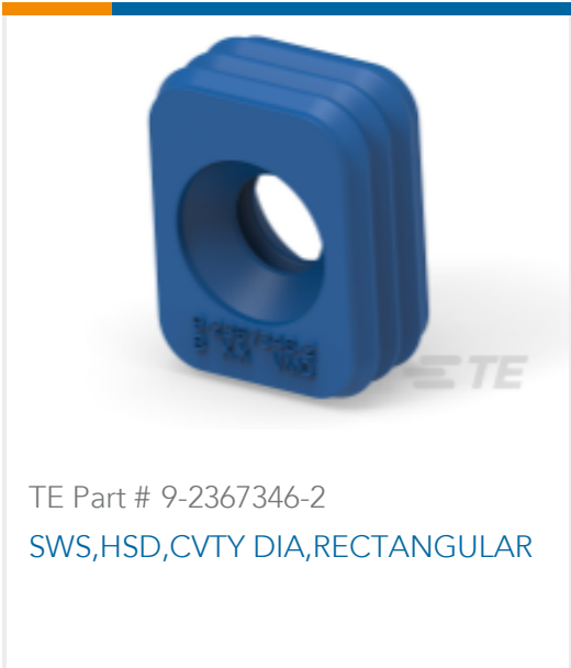
TE Part # 9-2367346-2 SWS,HSD,CVTY DIA,RECTANGULAR