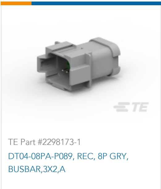
TE Part #2298173-1 DT04-08PA-P089, REC, 8P GRY, BUSBAR,3X2,A