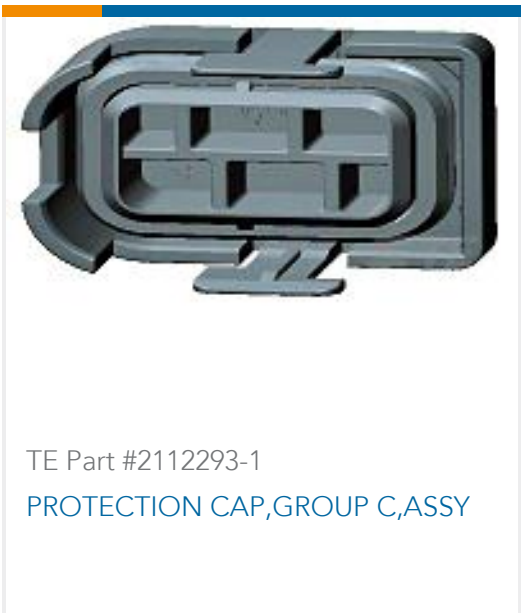
TE Part #2112293-1 PROTECTION CAP,GROUP C,ASSY