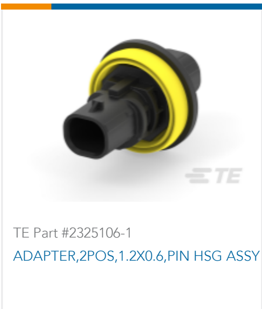
TE Part #2325106-1 ADAPTER,2POS,1.2X0.6,PIN HSG ASSY