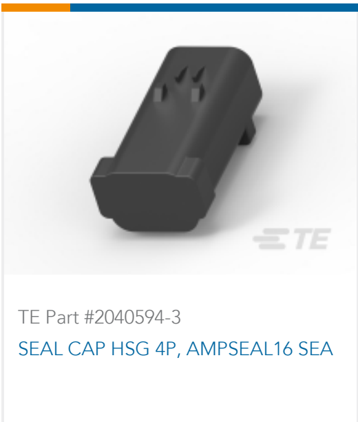
TE Part #2040594-3 SEAL CAP HSG 4P, AMPSEAL16 SEA