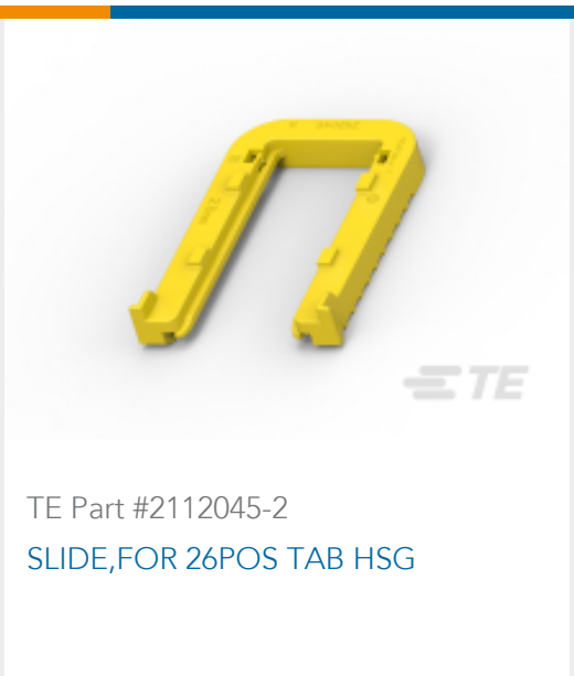
TE Part #2112045-2 SLIDE,FOR 26POS TAB HSG