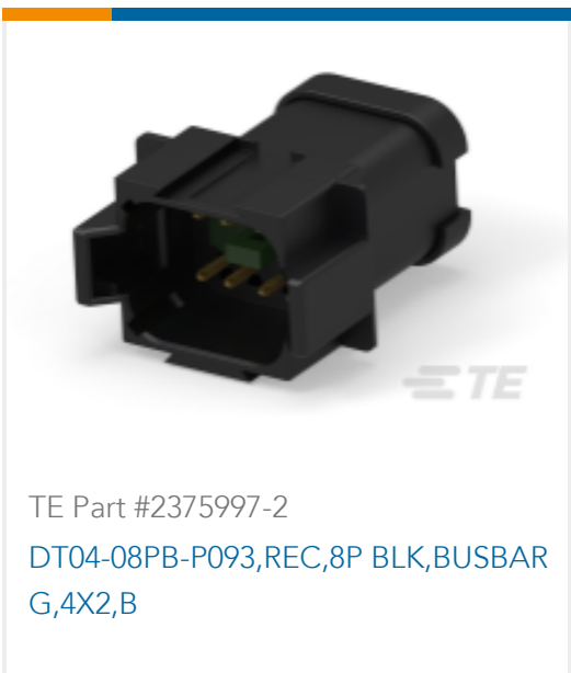
TE Part #2375997-2 DT04-08PB-P093,REC,8P BLK,BUSBAR G,4X2,B