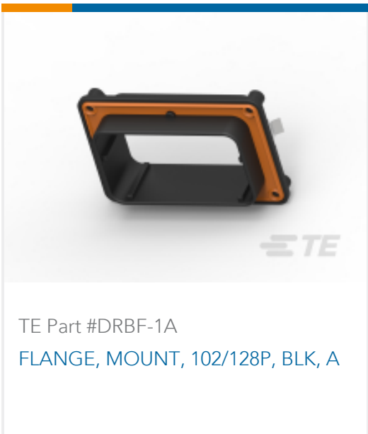
TE Part #DRBF-1A FLANGE, MOUNT, 102/128P, BLK, A