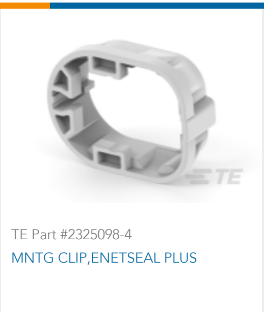
TE Part #2325098-4 MNTG CLIP,ENETSEAL PLUS