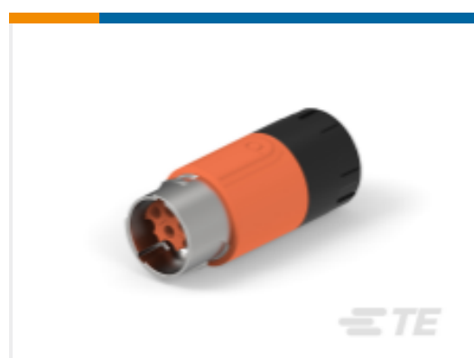
TE Part #EKB201N00330500000 915 EXTENSION