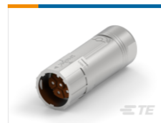
TE Part #BSA085F54480100000 923 PLUG, SPEEDTEC