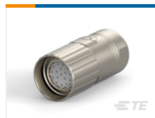
TE Part #ASA014F01410235000 623 PLUG