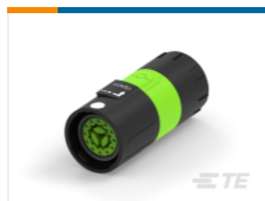
TE Part #ESB002N00310001000 615 PLUG