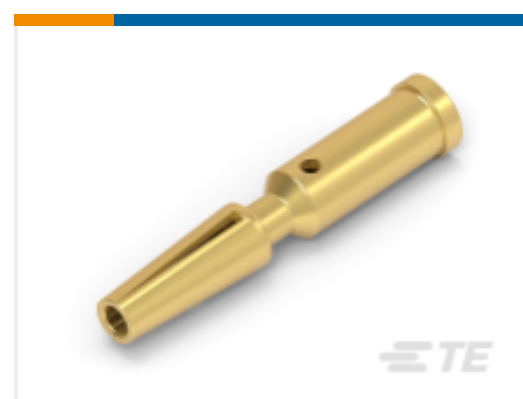
TE Part #60-0252-011-000 CONTACT SOCKET 1 MM