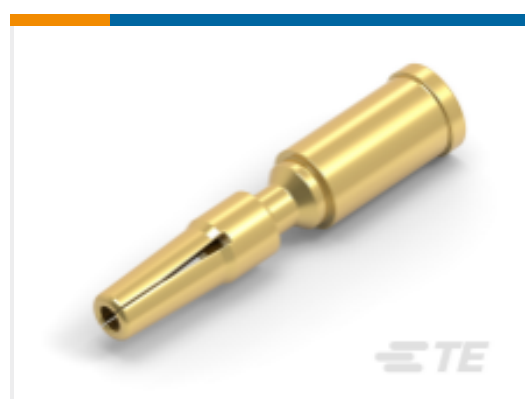
TE Part #60-0251-011-000 CONTACT SOCKET 1 MM