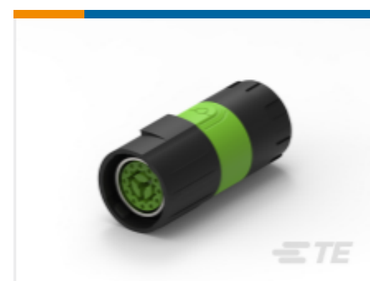
TE Part #ESB002N00320001000 615 PLUG