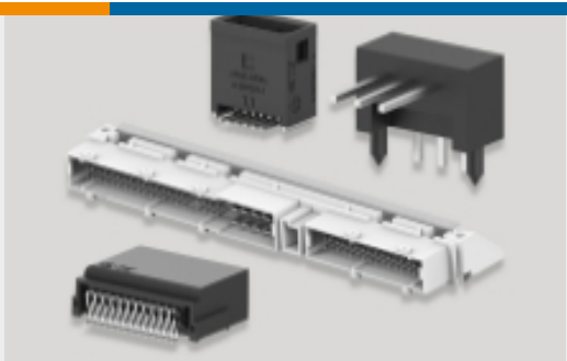
PCB Headers & Receptacles(1)