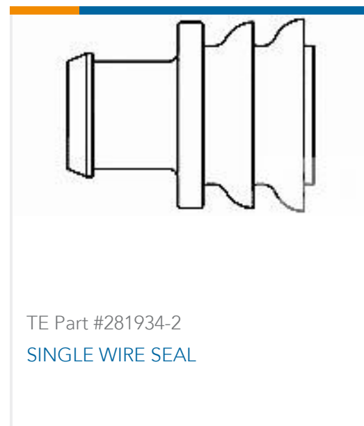
TE Part #281934-2 SINGLE WIRE SEAL