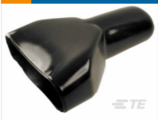
TE Part #DRC70-BT BOOT, 70P, 16SZ, PLG/REC, ST, BLK