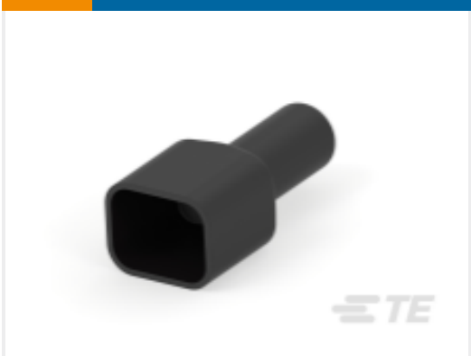
TE Part #DT8P-BT-BK BOOT, 8P, REC, ST, BLK