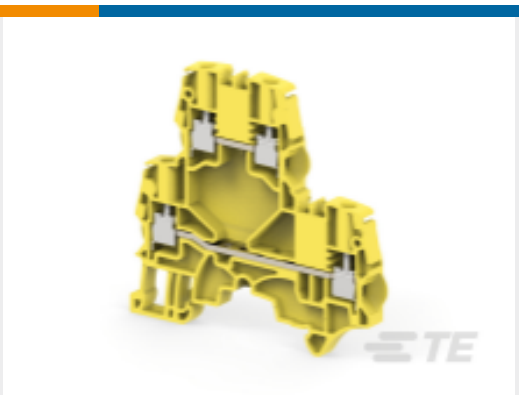
TE Part #1SNK505230R0000 ZS4-D2-OR