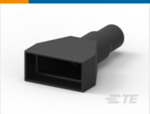
TE Part #DRC40-BT BOOT, 40P, 16SZ, PLG/REC, ST, BLK