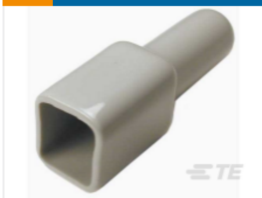
TE Part #DT4P-BT BOOT, 4P, REC, ST, GRY