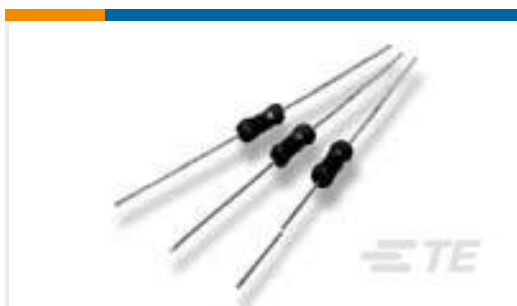
TE Part #7-1625890-0 2W SM M/OX 5% 82K