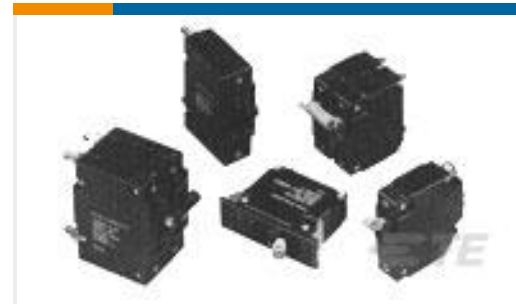
TE Part #6-1393252-1 W67-X2Q12-30=M6/M7/M9/W6/W7