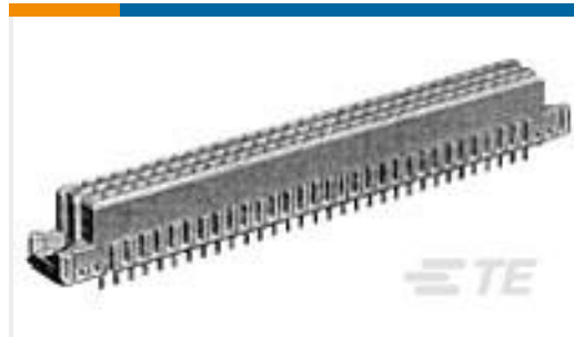
TE Part #535090-4 096 EURO TYPE C RECEPT ST ASSY