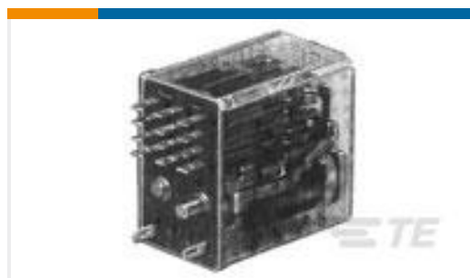
TE Part #1-1393766-9 R10-E1X4-24V=R10