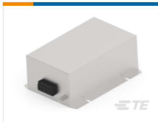
TE Part #1-1609968-5 KEP 25A 1S HIGH PLUS SP WYE 440VAC