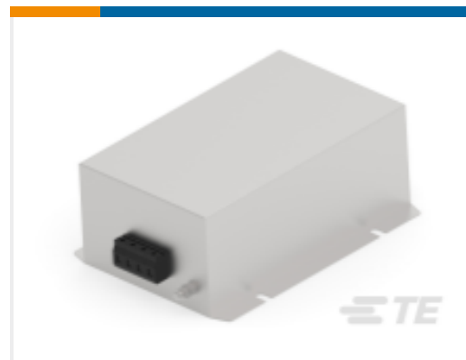
TE Part #1-1609968-6 KEP 36A 1S HIGH PLUS SP WYE 440VAC