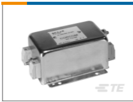
TE Part #6609069-3 Single Phase Filters, Corcom FC Series