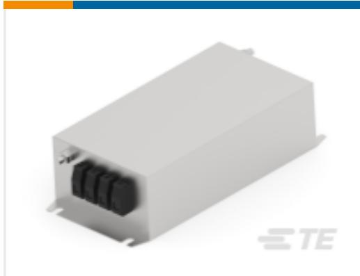
TE Part #2-1609968-0 KEP 60A 1S HIGH PLUS SP WYE 440VAC