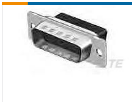
TE Part #205204-9 CRIMP SNAP PLUG ASSY, SIZE 1