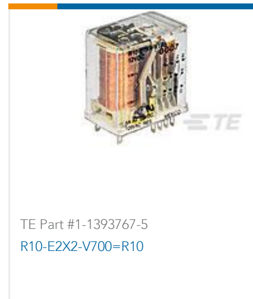
TE Part #1-1393767-5 R10-E2X2-V700=R10