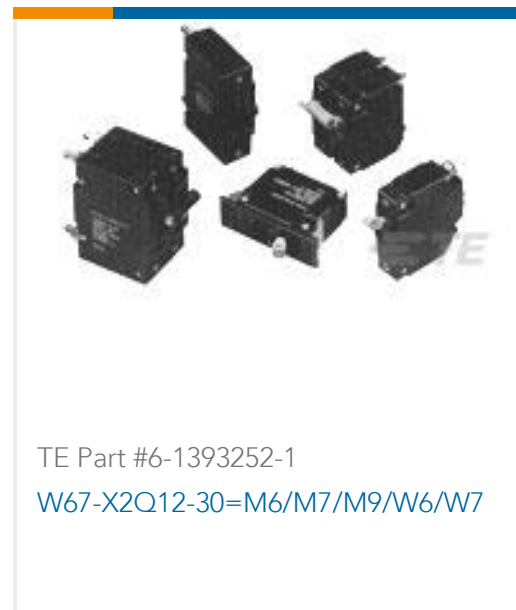
TE Part #6-1393252-1 W67-X2Q12-30=M6/M7/M9/W6/W7