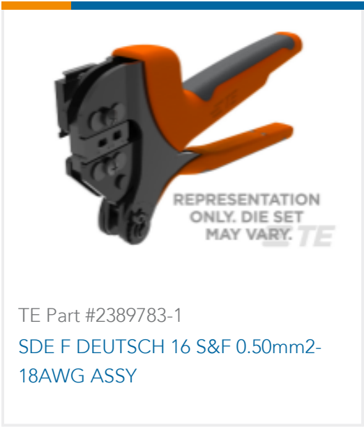
TE Part #2389783-1 SDE F DEUTSCH 16 S&F 0.50mm2- 18AWG ASSY