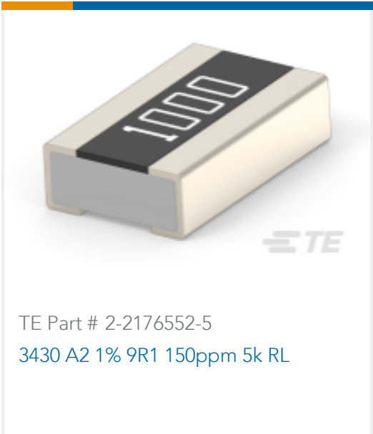
TE Part # 2-2176552-5 3430 A2 1% 9R1 150ppm 5k RL