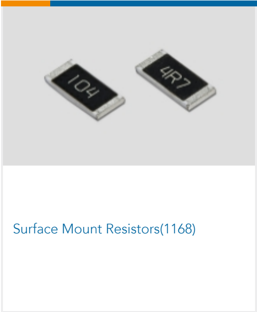
Surface Mount Resistors(1168)