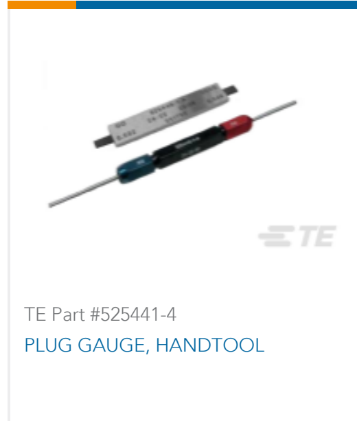
TE Part #525441-4 PLUG GAUGE, HANDTOOL