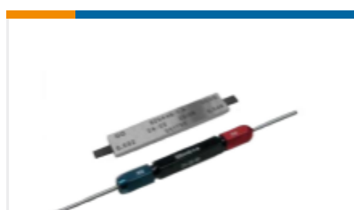
TE Part #523763-2 PLUG GAUGE, HANDTOOL