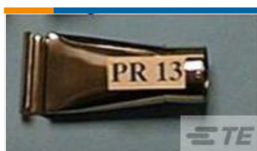
TE Part #991963-000 PR-13-REFLECTOR