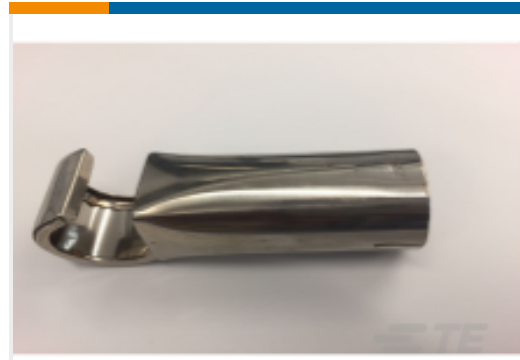
TE Part #991974-000 PR-13C-REFLECTOR