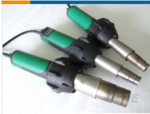
TE Part #EG1114-000 CV1981-ST-230V1600W-EU