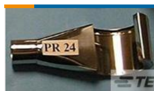
TE Part #991964-000 PR-24-REFLECTOR