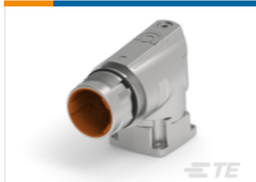
TE Part #BGC106N00001216000 923 RECEPTACLE, ANGLED, ROTATABLE