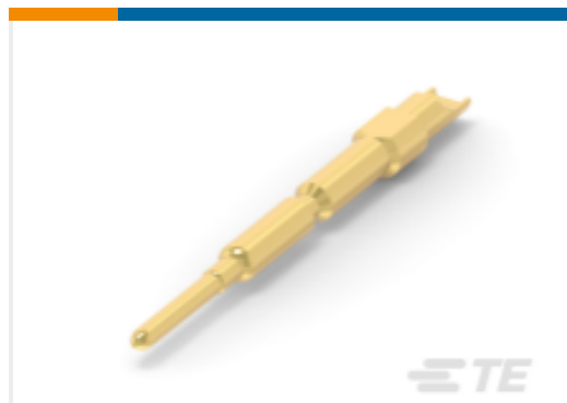
TE Part #61-0006-011-000 CONTACT PIN 1 MM