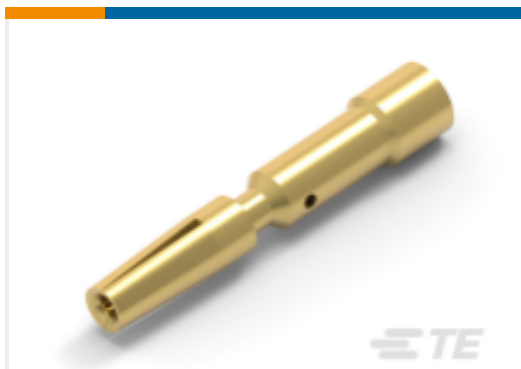
TE Part #60-0011-011-000 CONTACT SOCKET 1 MM