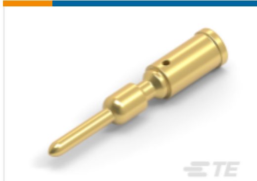
TE Part #61-0231-011-000 CONTACT PIN 1 MM