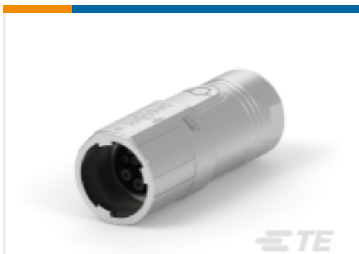
TE Part #BSA601N0086127A000 917 plug, speedtec