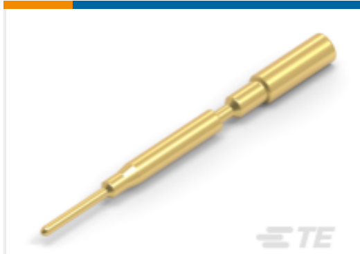
TE Part #61-0178-011-000 CONTACT PIN 0.6 MM