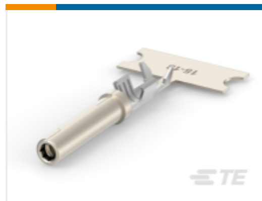
TE Part #4-2600021-3 XRC SOCKET 16-20 AWG Ni Plated