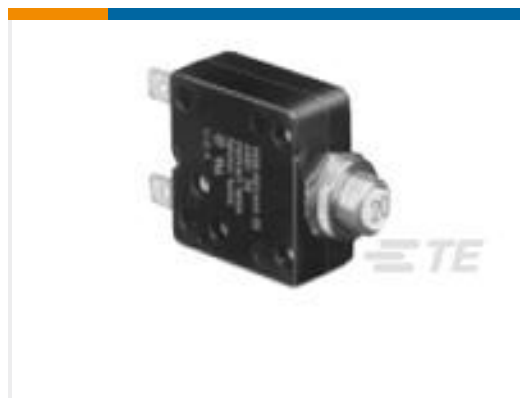
TE Part #4-1393249-6 W58-XC4C12A-30=W58