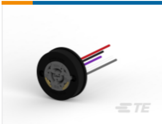
TE Part #2213627-1 ASSEMBLY, ROT DIM REC 49.22MM 5 POS 150C