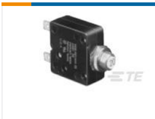
TE Part #4-1393249-3 W58-XC4C12A-20=W58