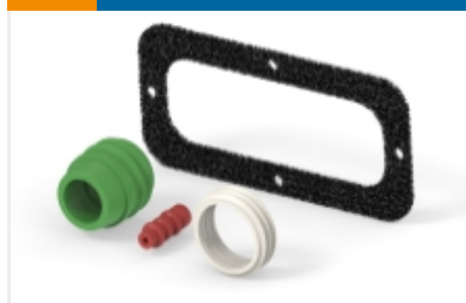
Connector Seals & Cavity Plugs(1)