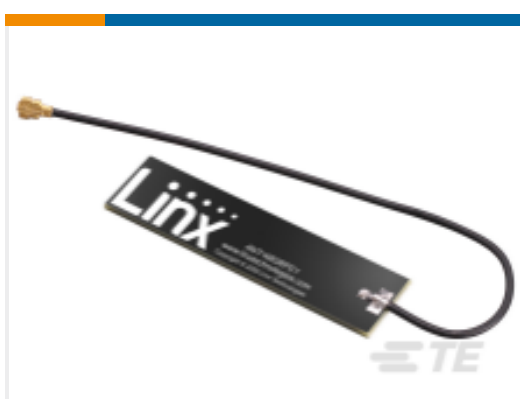
TE Part #L9000234-01 Antenna WIFI6 2.4/5/6 GHz RPC UFL 100