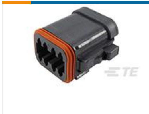
TE Part #DT06-08SB-CE01 PLG, 8P, BLK, E, CAP, B