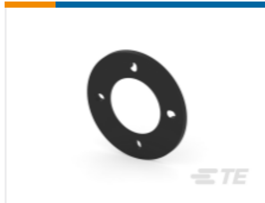
TE Part #2213626-1 GASKET, SEALING ROT DIM RECEP