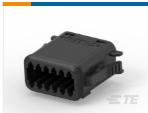
TE Part #2600043-8 12CCT PLUG BLACK K A W/LARGE SEAL