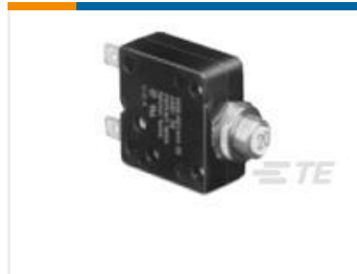
TE Part #4-1393249-1 W58-XC4C12A-15=W58