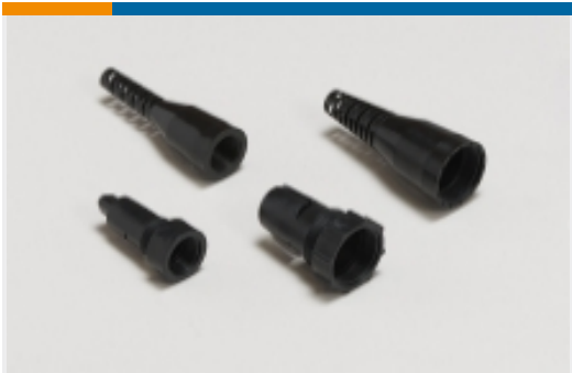
Connector Strain Relief(5)