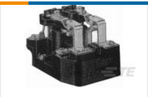
TE Part #5-1393127-5 PRD-11DJ0-24=PRD