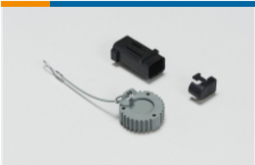
Automotive Connector Caps & Covers (14)