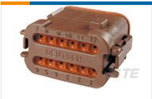
TE Part #DT06-12SD-EP06 PLG, 12P, BRN, N, SEAL RET,ENH KEY, CAP,D