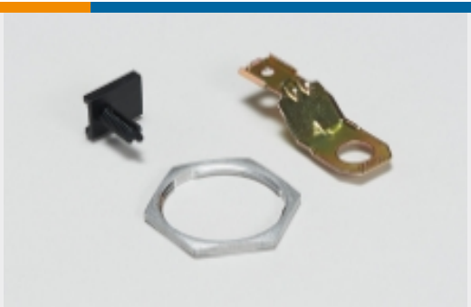
Other Automotive Connector Accessories(6)