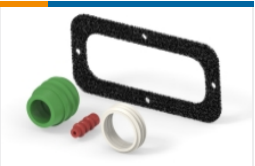
Connector Seals & Cavity Plugs(11)