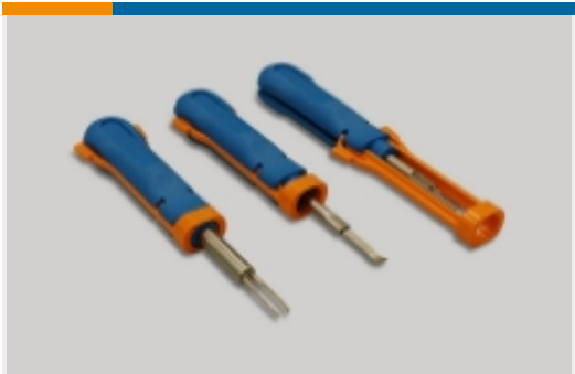
Insertion & Extraction Tools(10)