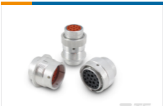
TE Part #HD34-24-29PE-059 DEUTSCH HD30 Housings