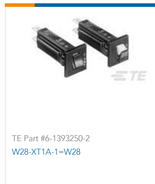
TE Part #6-1393250-2 W28-XT1A-1=W28