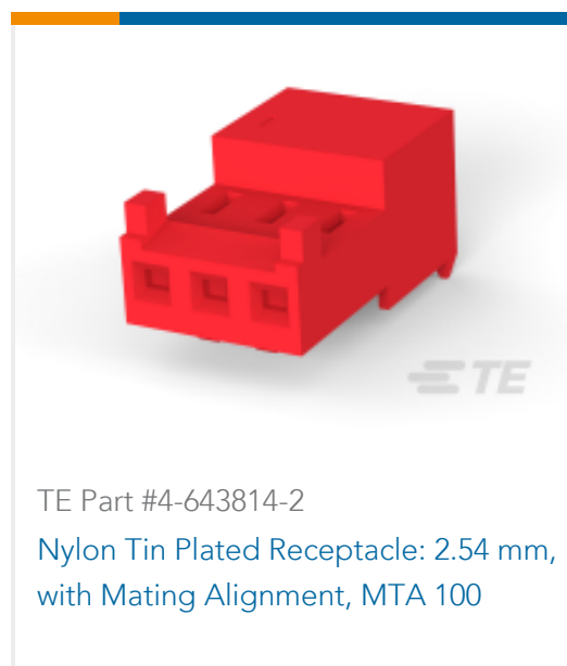
TE Part #4-643814-2 Nylon Tin Plated Receptacle: 2.54 mm, with Mating Alignment, MTA 100