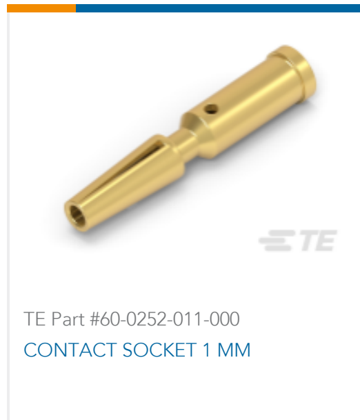
TE Part #60-0252-011-000 CONTACT SOCKET 1 MM