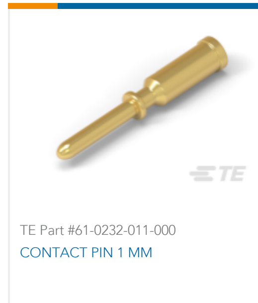
TE Part #61-0232-011-000 CONTACT PIN 1 MM