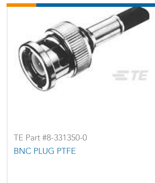
TE Part #8-331350-0 BNC PLUG PTFE