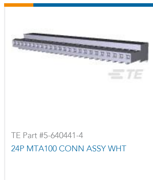
TE Part #5-640441-4 24P MTA100 CONN ASSY WHT