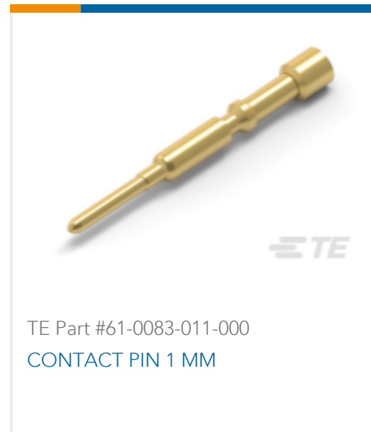
TE Part #61-0083-011-000 CONTACT PIN 1 MM