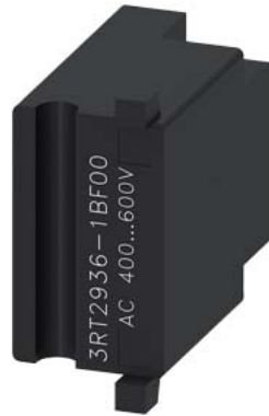
Surge suppressor, varistor, 400 ... 600 V AC, for contactors Size S2, S3