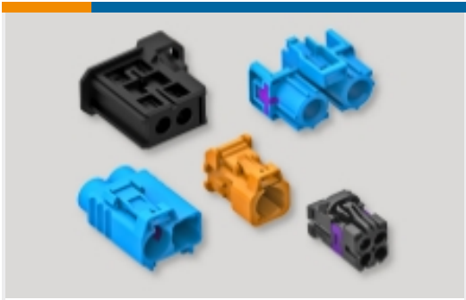
Data Connectivity Housings(18)