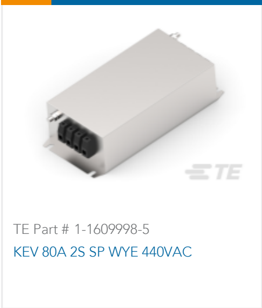
TE Part # 1-1609998-5 KEV 80A 2S SP WYE 440VAC

This information is provided based on reasonable inquiry of our suppliers and represents our current actual knowledge based on the information they provided. This information is subject to change. The part numbers that TE has identified as EU RoHS compliant have a maximum concentration of 0.1% by weight in homogenous materials for lead, hexavalent chromium, mercury, PBB, PBDE, DBP, BBP, DEHP, DIBP, and 0.01% for cadmium, or qualify for an exemption to these limits as defined in the Annexes of Directive 2011/65/EU (RoHS2). Finished electrical and electronic equipment products will be CE marked as required by Directive 2011/65/EU. Components may not be CE marked. Additionally, the part numbers that TE has identified as EU ELV compliant have a maximum concentration of 0.1% by weight in homogenous materials for lead, hexavalent chromium, and mercury, and 0.01% for cadmium, or qualify for an exemption to these limits as defined in the Annexes of Directive 2000/53/EC (ELV). Regarding the REACH Regulation, the information TE provides on SVHC in articles for this part number is based on the latest European Chemicals Agency (ECHA) ‘Guidance on requirements for substances in articles’ posted at this URL: https://echa.europa.eu/guidance-documents/guidance-on-reach