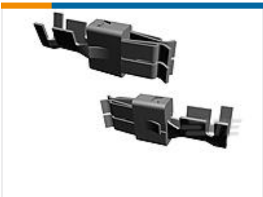
TE Part #927831-2 SPT REC 6.3 Contact SRC Sn