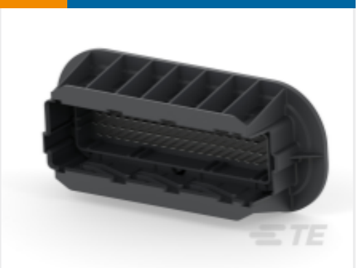
TE Part #2-967677-1 3,0MESSERLEIS 55P