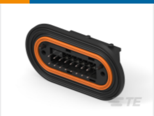
TE Part #2-968814-2 MESSERLEISTE3,0 16P