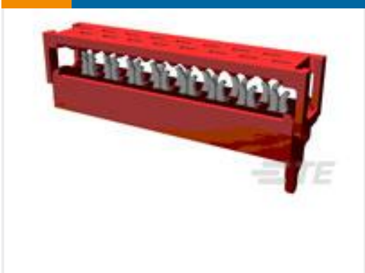
TE Part #215083-8 MICRO-MATCH MOW.08P