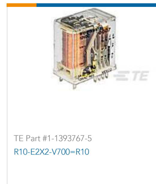
TE Part #1-1393767-5 R10-E2X2-V700=R10