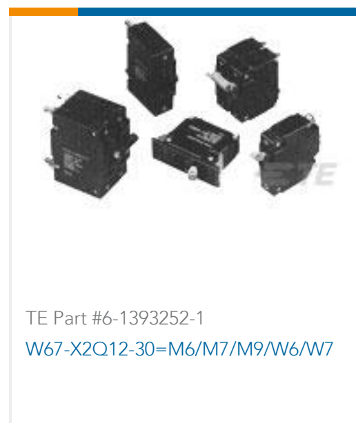
TE Part #6-1393252-1 W67-X2Q12-30=M6/M7/M9/W6/W7