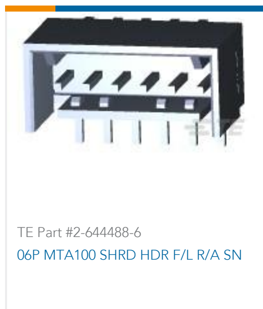
TE Part #2-644488-6 06P MTA100 SHRD HDR F/L R/A SN