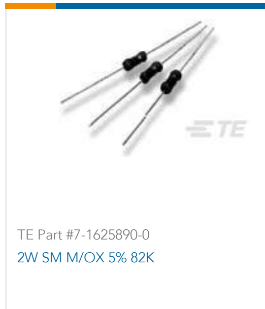
TE Part #7-1625890-0 2W SM M/OX 5% 82K