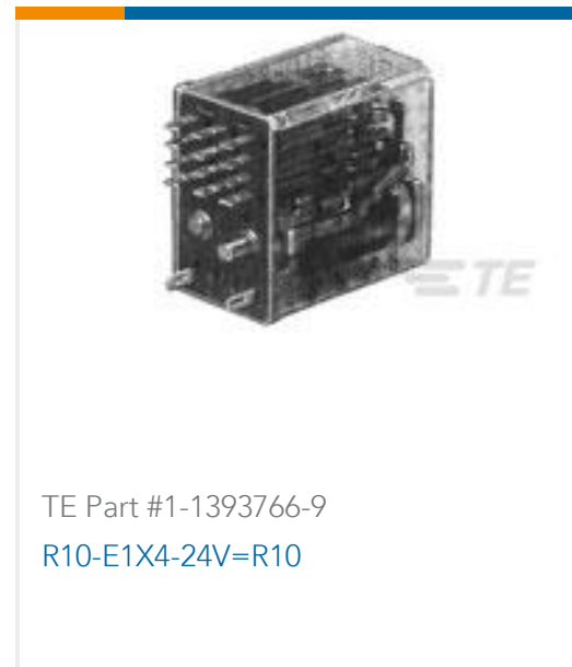
TE Part #1-1393766-9 R10-E1X4-24V=R10