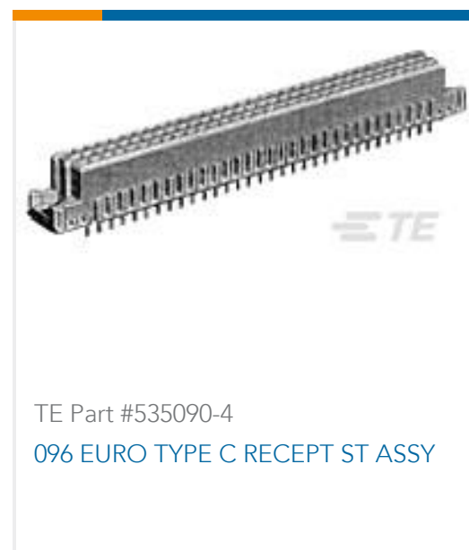
TE Part #535090-4 09% EURO TYPE C RECEPT ST ASSY