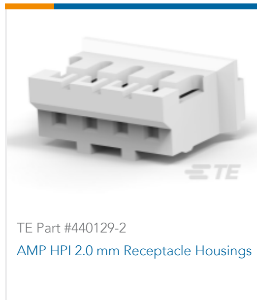
TE Part #440129-2 AMP HPI 2.0 mm Receptacle Housings