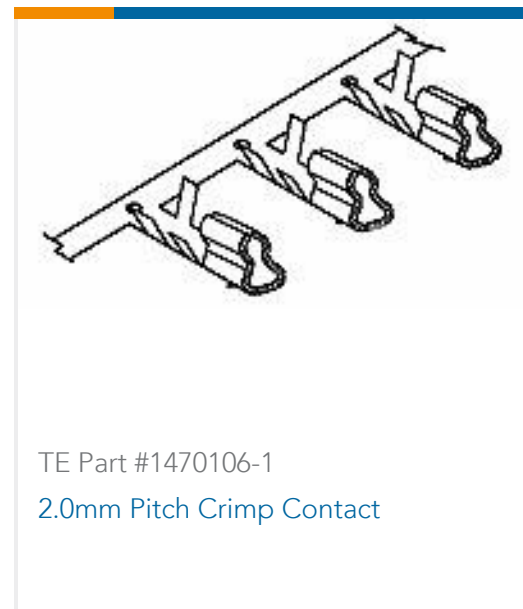
TE Part #1470106-1 2.0mm Pitch Crimp Contact