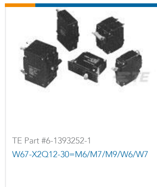
TE Part #6-1393252-1 W67-X2Q12-30=M6/M7/M9/W6/W7