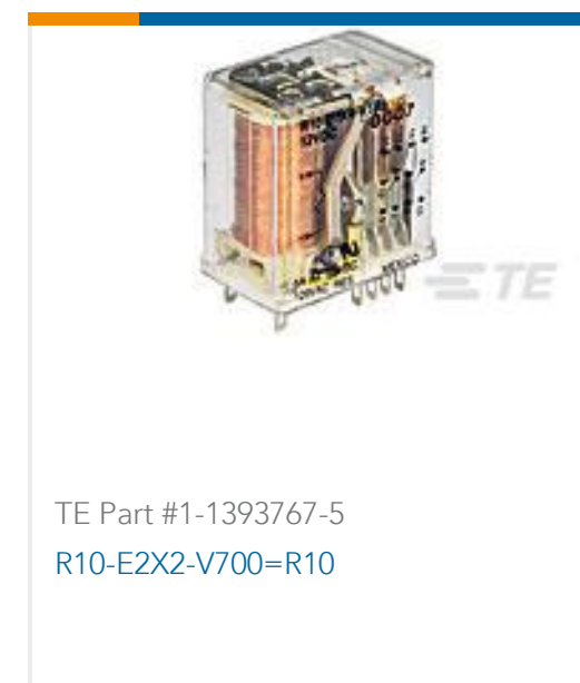
TE Part #1-1393767-5 R10-E2X2-V700=R10