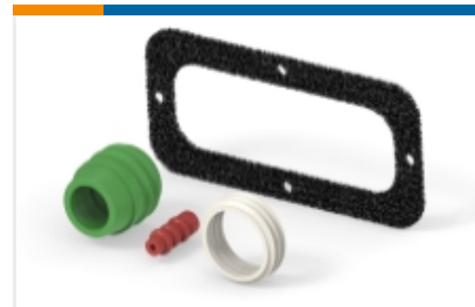
Connector Seals & Cavity Plugs(1)