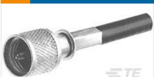
TE Part #226600-1 UHF PLUG-MINIATURE