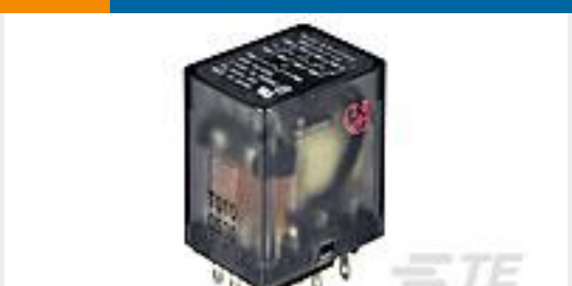
TE Part #4-1393122-0 KHAU-17A18-240=KH