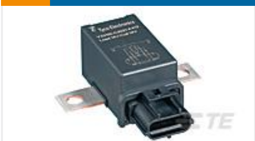
TE Part #1-1414939-4 V23130C2021A412-EV-CBOX