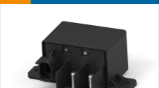
TE Part #7-1414968-8 V23132A2001A200-EV-USBX