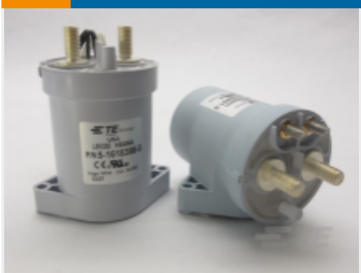
TE Part #8-1618404-1 LEV200AKNAF=RELAY, SPST-NO 72VDC