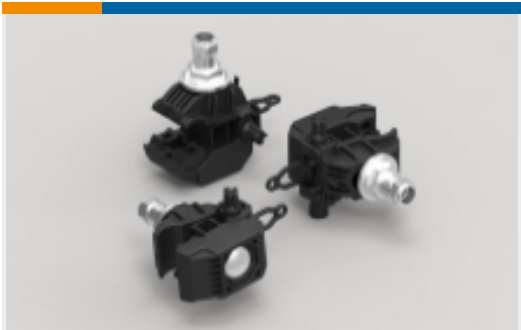
Street Lighting Connectors(2)