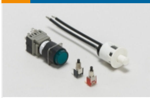
Push Button Switches(165)