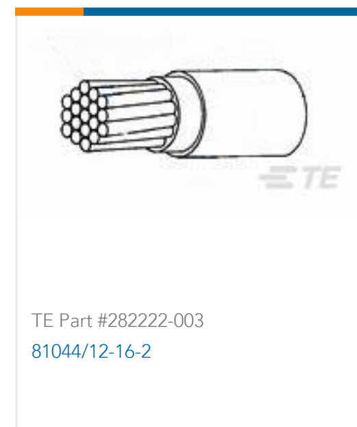
TE Part #282222-003 81044/12-16-2