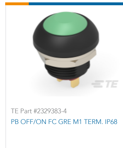
TE Part #2329383-4 PB OFF/ON FC GRE M1 TERM. IP68