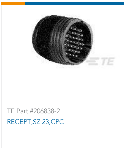
TE Part #206838-2 RECEPT,SZ 23,CPC