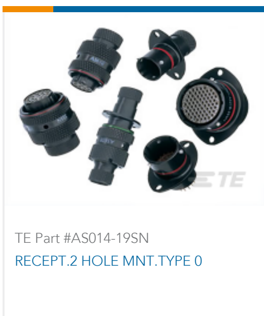
TE Part #AS014-19SN RECEPT.2 HOLE MNT.TYPE 0