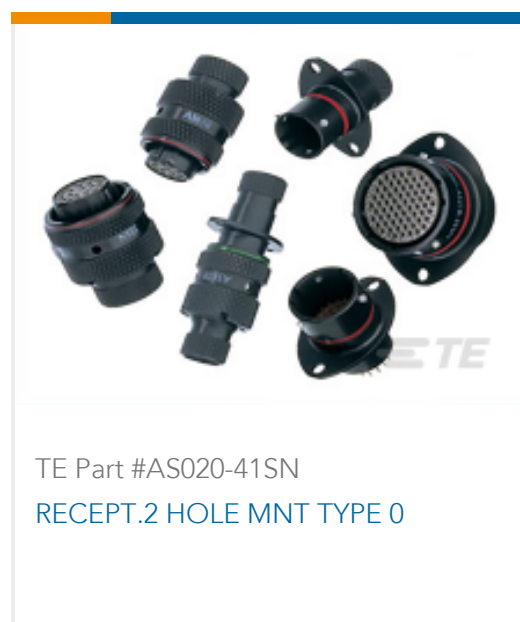
TE Part #AS020-41SN RECEPT.2 HOLE MNT TYPE 0