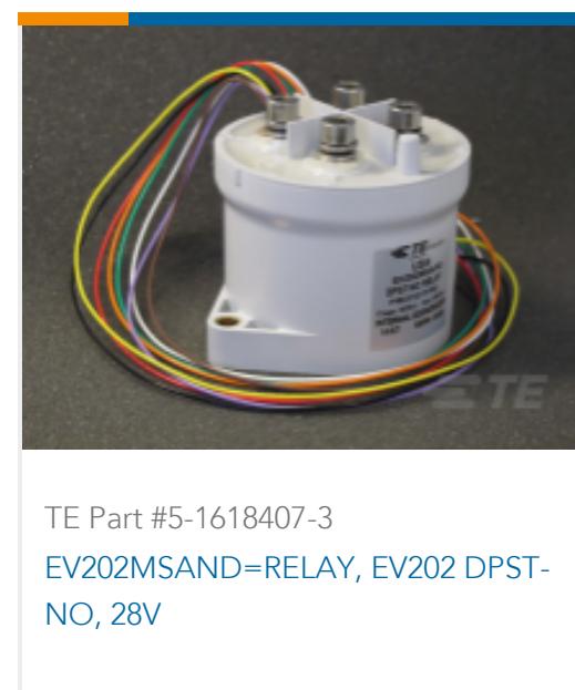
TE Part #5-1618407-3 EV202MSAND=RELAY, EV202 DPST-NO, 28V