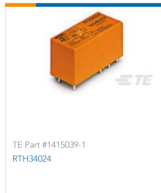
TE Part #1415039-1 RTH34024