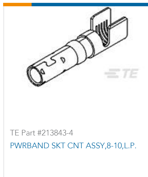
TE Part #213843-4 PWRBAND SKT CNT ASSY,8-10,L.P.