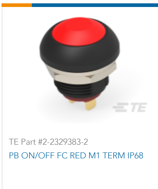
TE Part #2-2329383-2 PB ON/OFF FC RED M1 TERM IP68