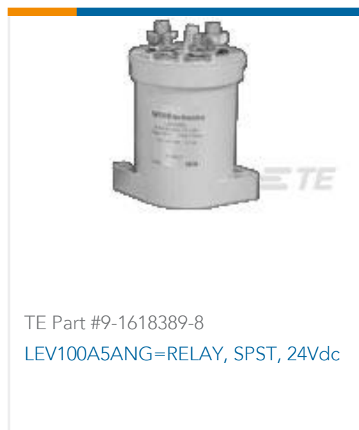
TE Part #9-1618389-8 LEV100A5ANG=RELAY, SPST, 24Vdc