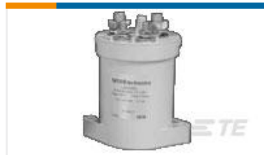
TE Part #1618387-3 LEV200A4ANA=RELAY, SPST-NO