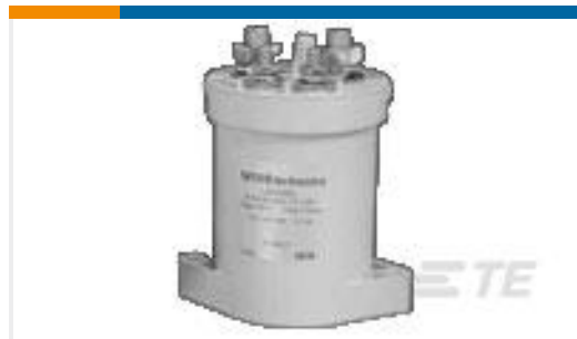
TE Part #3-1618389-7 LEV100A4ANG=RELAY, 12Vdc SPST-NO