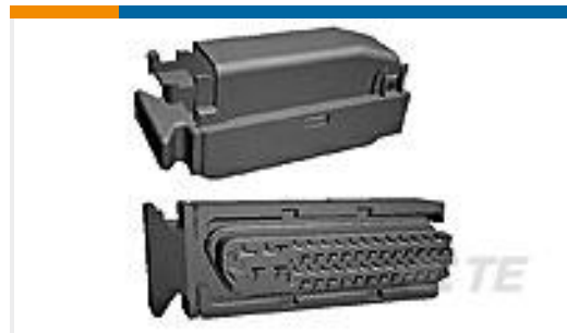
TE Part #1393450-3 V23542C1052B102=52P KABELBAUM