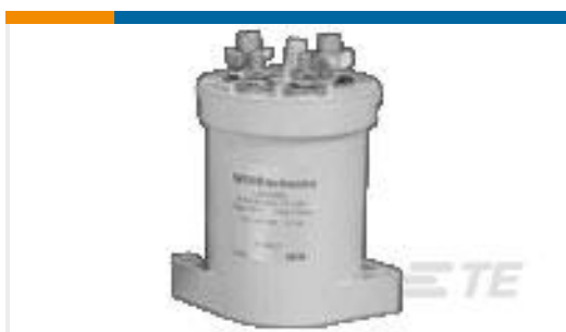
TE Part #1618387-7 LEV200A4NAA=RELAY, SPST-NO