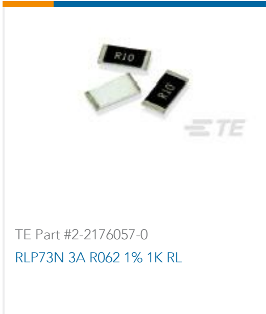
TE Part #2-2176057-0 RLP73N 3A R062 1% 1K RL