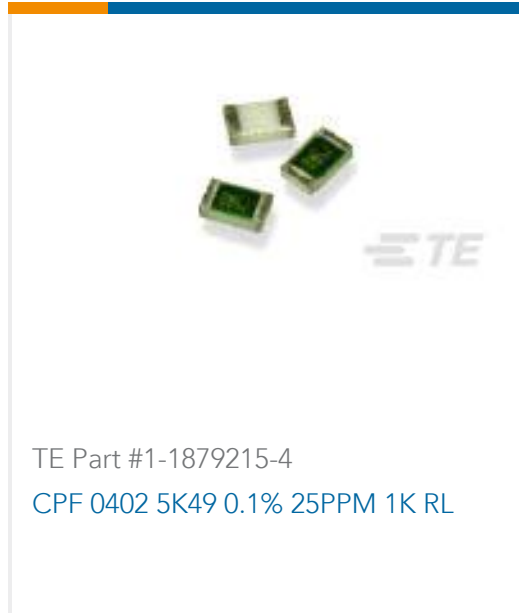
TE Part #1-1879215-4 CPF 0402 5K49 0.1% 25PPM 1K RL