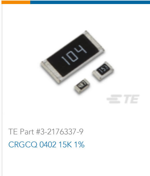
TE Part #3-2176337-9 CRGCQ 0402 15K 1%