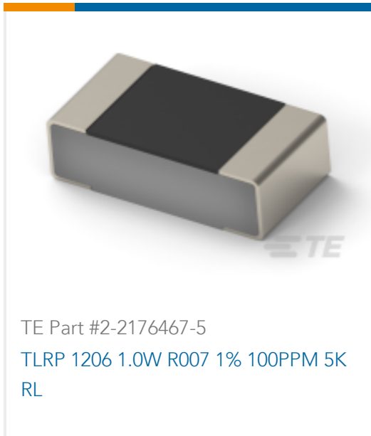
TE Part #2-2176467-5 TLRP 1206 1.0W R007 1% 100PPM 5K RL