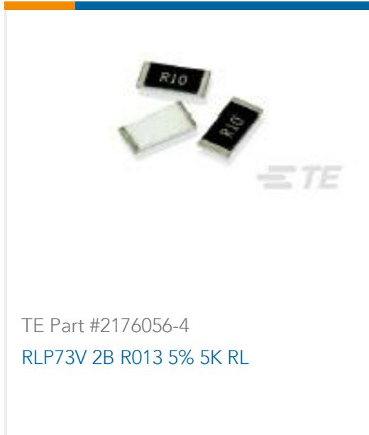
TE Part #2176056-4 RLP73V 2B R013 5% 5K RL