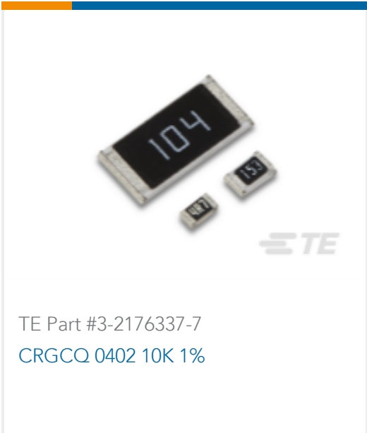
TE Part #3-2176337-7 CRGCQ 0402 10K 1%