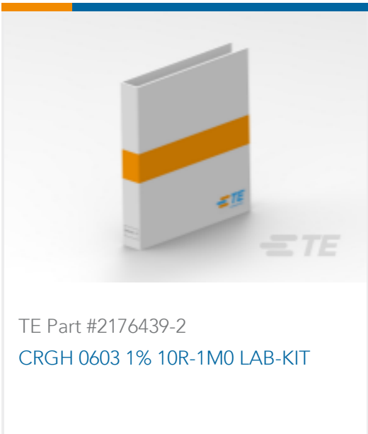
TE Part #2176439-2 CRGH 0603 1% 10R-1M0 LAB-KIT