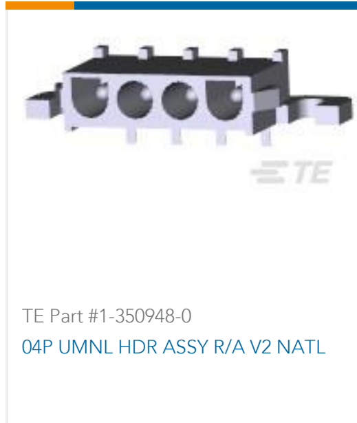
TE Part #1-350948-0 04P UMNL HDR ASSY R/A V2 NATL