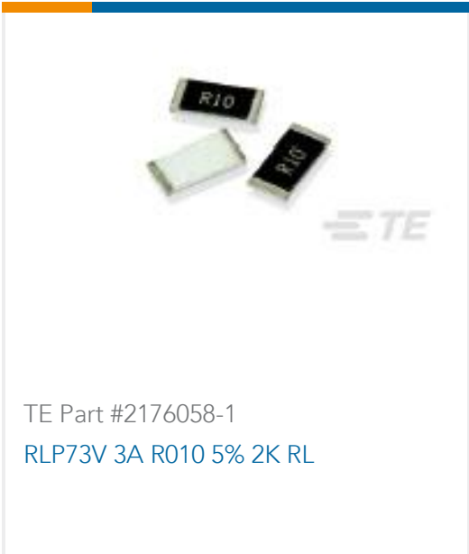
TE Part #2176058-1 RLP73V 3A R010 5% 2K RL