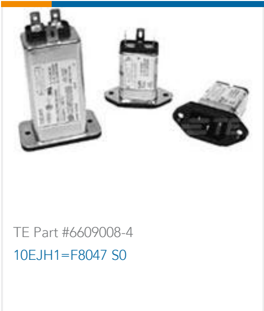
TE Part #6609008-4 10EJH1=F8047 S0