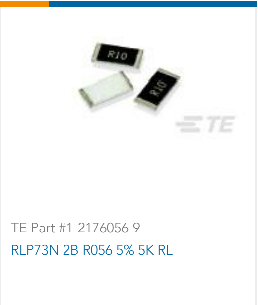
TE Part #1-2176056-9 RLP73N 2B R056 5% 5K RL