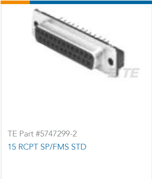
TE Part #5747299-2 15 RCPT SP/FMS STD