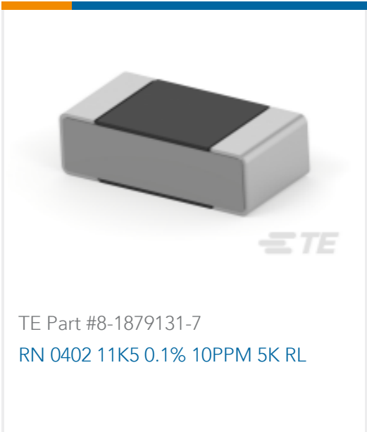
TE Part #8-1879131-7 RN 0402 11K5 0.1% 10PPM 5K RL