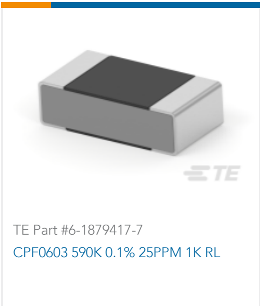
TE Part #6-1879417-7 CPF0603 590K 0.1% 25PPM 1K RL

Product Drawings RLP73K 2A R56 1% 1K RL English