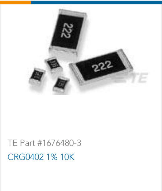
TE Part #1676480-3 CRG0402 1% 10K