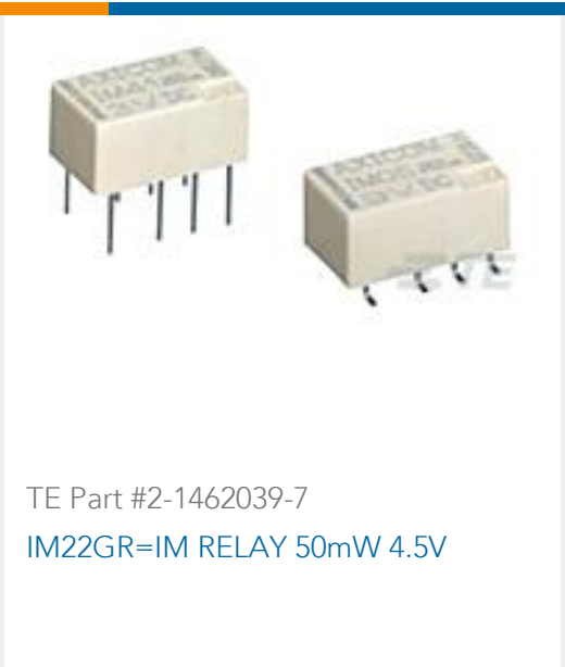
TE Part #2-1462039-7 IM22GR=IM RELAY 50mW 4.5V