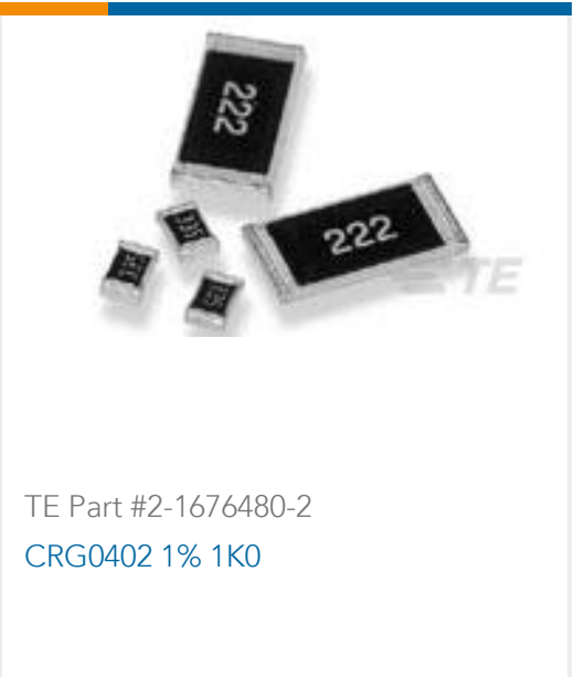
TE Part #2-1676480-2 CRG0402 1% 1K0