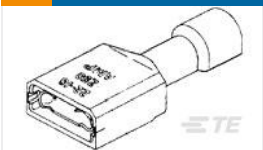
TE Part #3-520124-2 187 ULTRA-FAST ASY REC 16-14 AWG TPBR