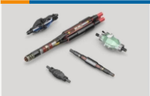
Joints & Splices(7)