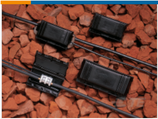
TE Part # 505941-000 GHFC-3-90(B6)