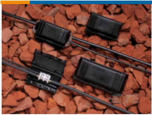
TE Part # 166533-000 GHFC-1-90(B100)