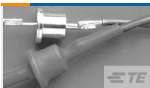
TE Part #5677912004 RNF-3000-3/1-X-STK