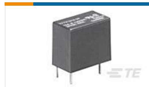
TE Part #1393194-9 T77S1D10-12