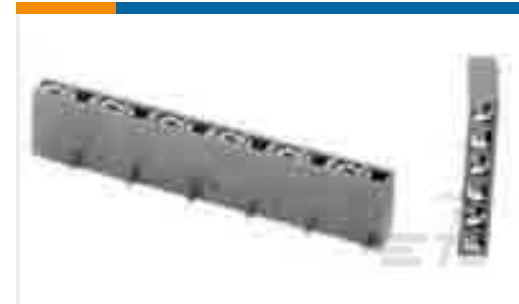
TE Part #1241152-6 6P HV100 REC. CON, SMD, GOLD, BLISTER