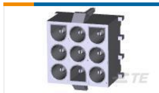
TE Part #641972-1 09P UMNL PIN HDR ASSY 94VO