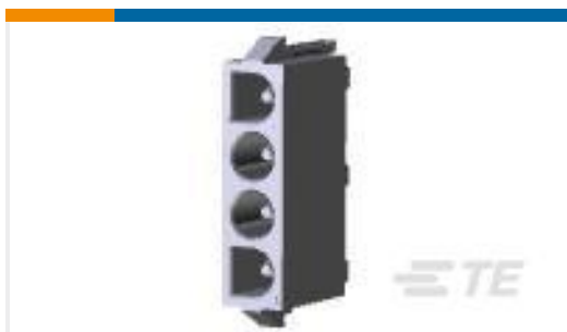
TE Part #641968-1 04P UMNL PIN HDR ASSY POL 94VO