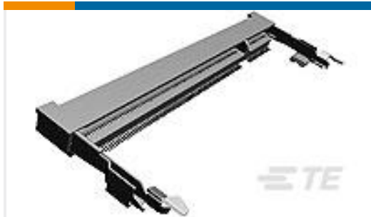
TE Part #1717254-4 EMBOSS ASSY DDR2 SODIMM SOCKET 200P 5.2H