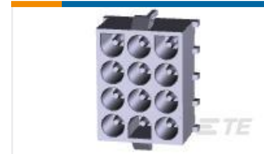
TE Part #641973-1 12P UMNL PIN HDR ASSY V2 NATL