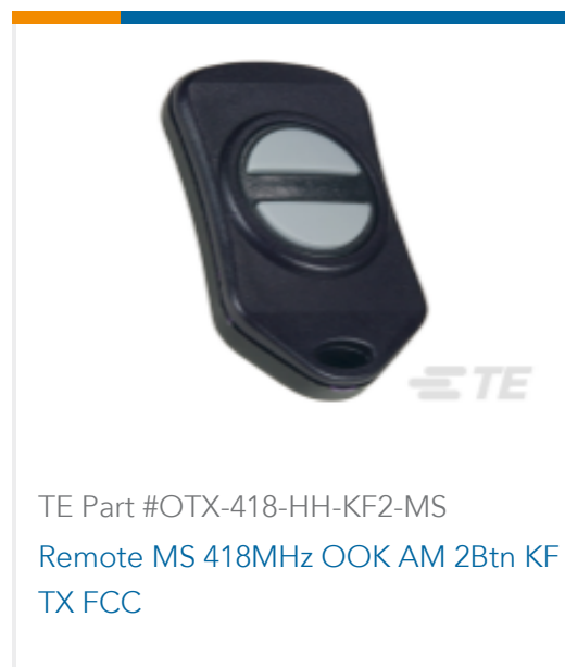
TE Part #OTX-418-HH-KF2-MS Remote MS 418MHz OOK AM 2Btn KF TX FCC