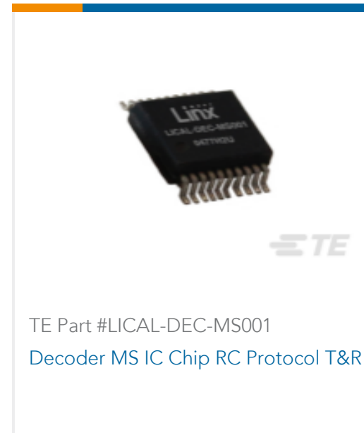
TE Part #LICAL-DEC-MS001 Decoder MS IC Chip RC Protocol T&R