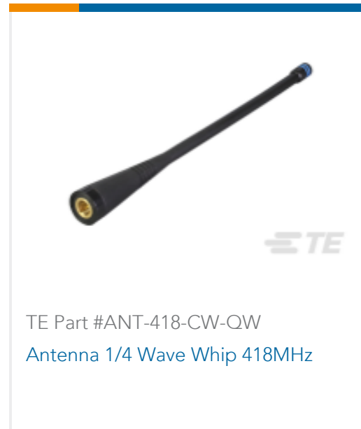
TE Part #ANT-418-CW-QW Antenna 1/4 Wave Whip 418MHz