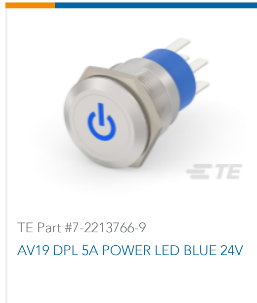
TE Part #7-2213766-9 AV19 DPL 5A POWER LED BLUE 24V