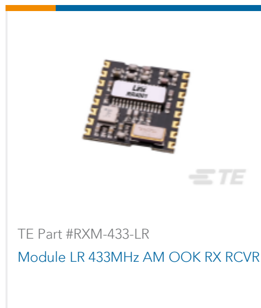
TE Part #RXM-433-LR Module LR 433MHz AM OOK RX RCVR