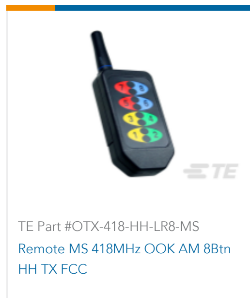
TE Part #OTX-418-HH-LR8-MS Remote MS 418MHz OOK AM 8Btn HH TX FCC