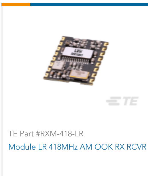
TE Part #RXM-418-LR Module LR 418MHz AM OOK RX RCVR