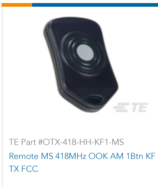
TE Part #OTX-418-HH-KF1-MS Remote MS 418MHz OOK AM 1Btn KF TX FCC