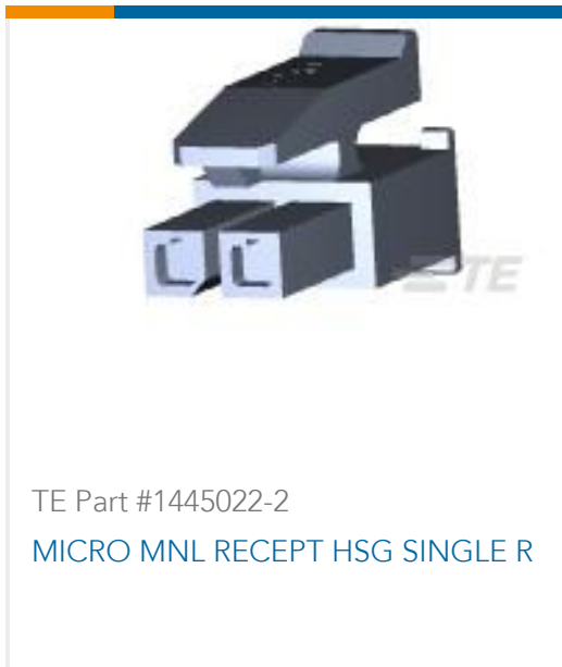
TE Part #1445022-2 MICRO MNL RECEPT HSG SINGLE R