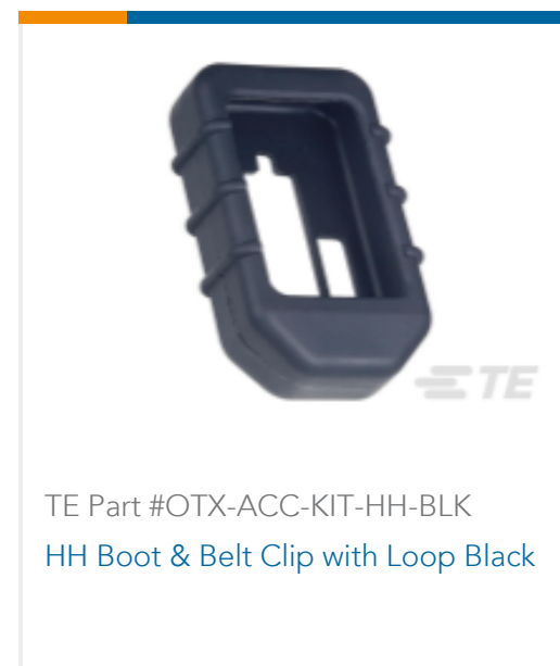
TE Part #OTX-ACC-KIT-HH-BLK HH Boot & Belt Clip with Loop Black