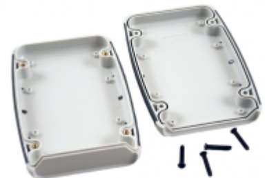
Key Internal Features